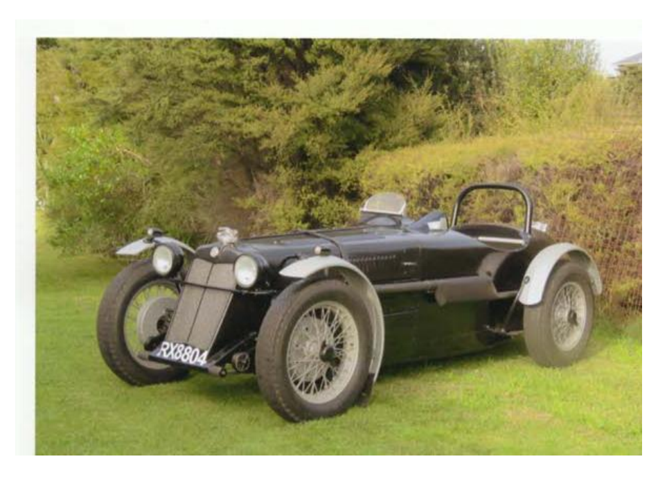
MG Special (December, 2018)