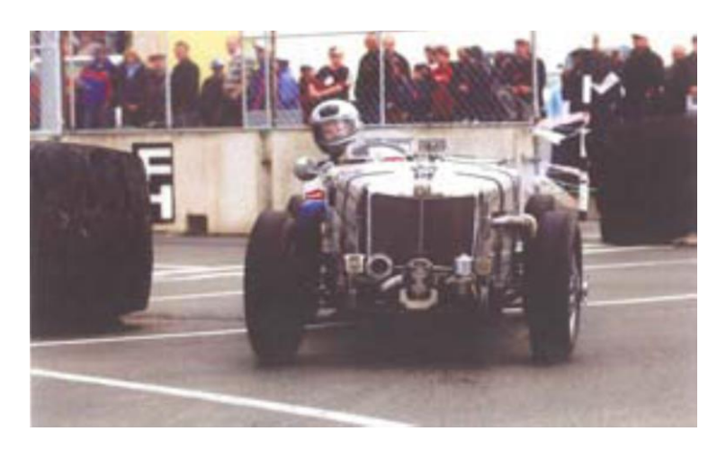
Through the chicane, Dunedin Street Race, 2007