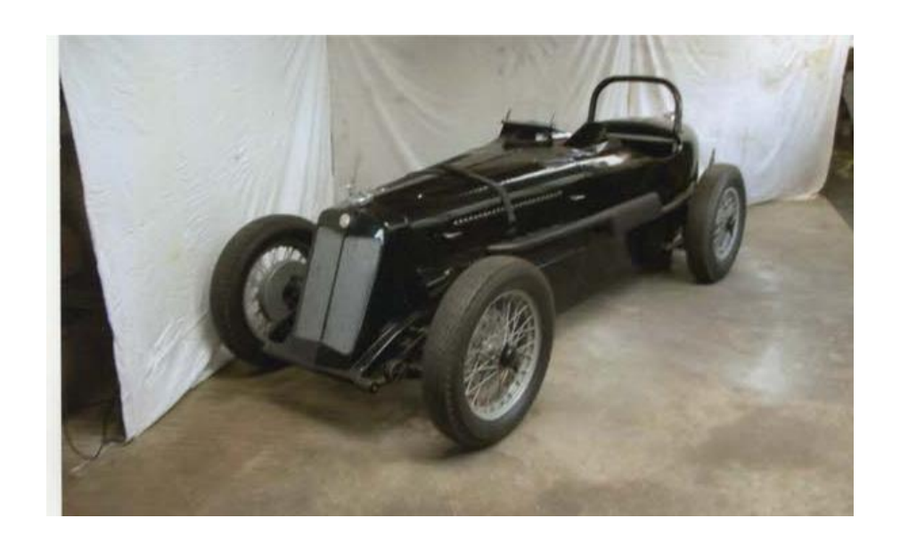
Lawrie's Competition special

The car will be fitted with an L type, 1100cc 6-cyl, OHC, counterbalanced crank and supercharged engine. The engine originally was from John Twhigg's L 2058, and is now fitted with an N Type head. The transmission has an upgraded diff with ENV components and the brakes are Girling cable type as used on the R Type.