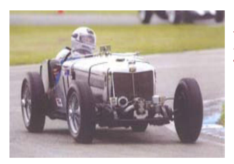
Timaru Levels Raceway, 2007. Note the Cooper behind which could not catch the MG